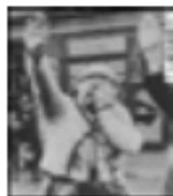
"Heil Hitler! You are right!"